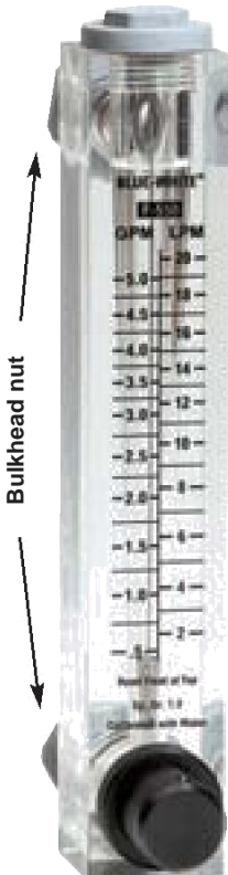
F-550A with Flow Adjustment Valve