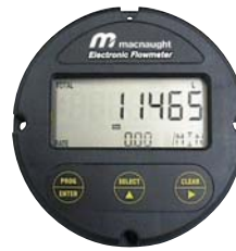
Standard LC Display