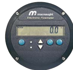
Deluxe LC Display